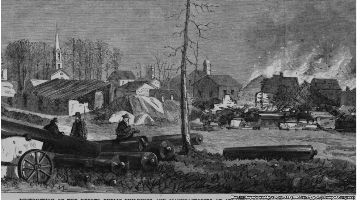
Illus. [in Harper's Weekly, v. 3, no. 410 (1863, Jan. 7), p. 4. ]